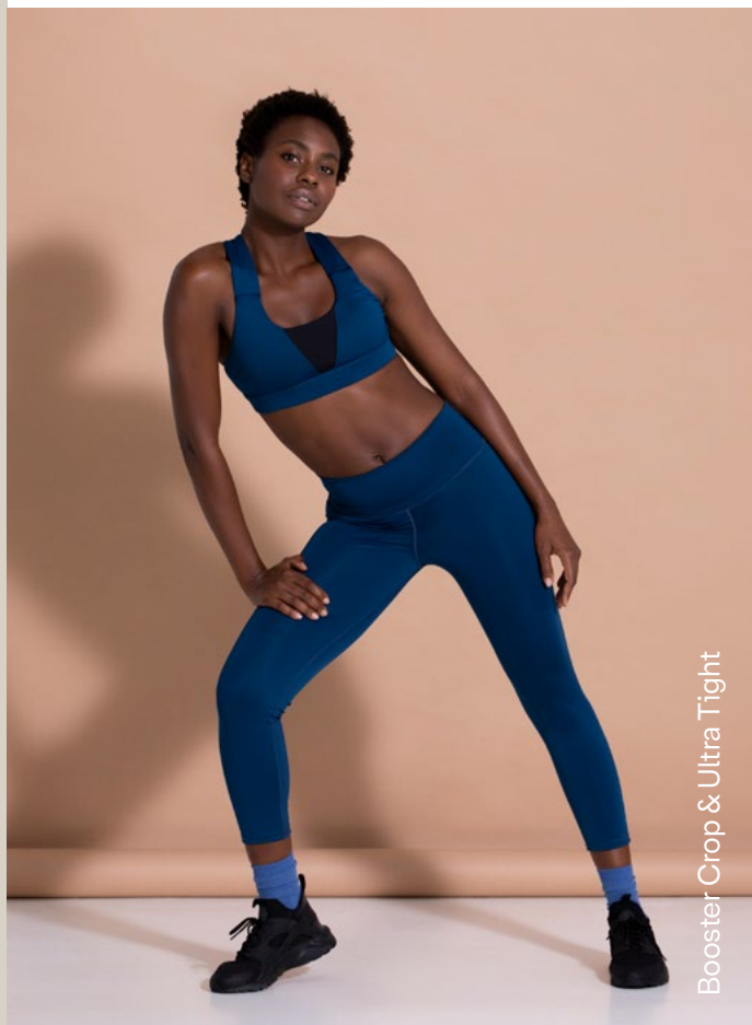
Booster Crop & Ultra Tight