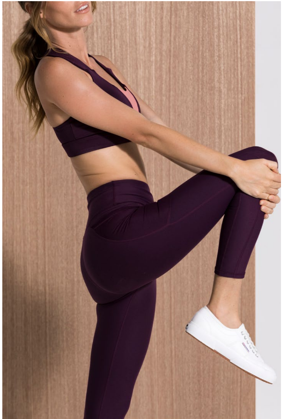
Booster Crop & Lively Tight