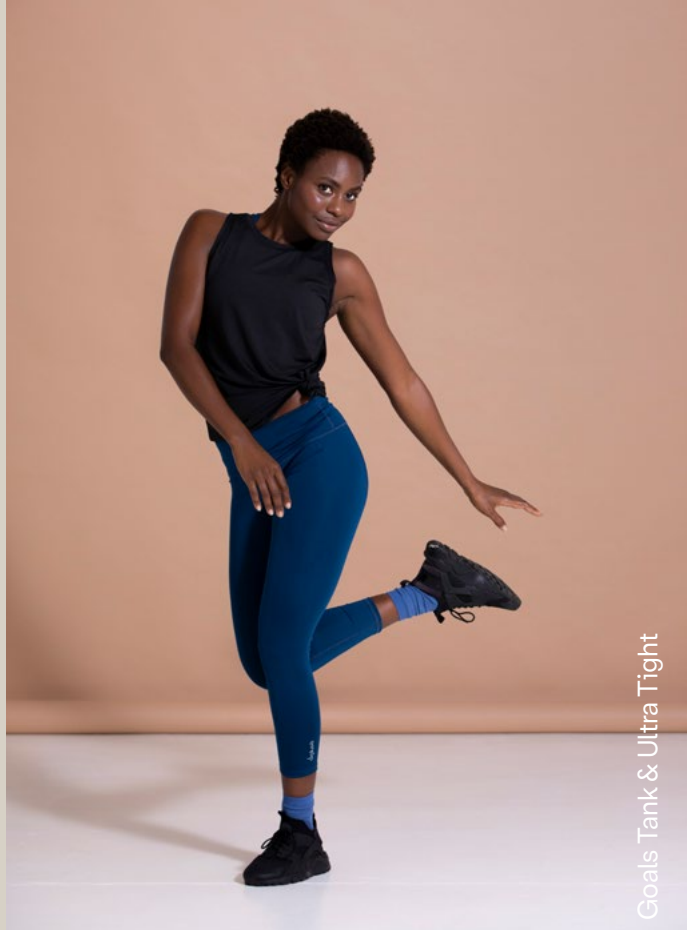
Goals Tank & Ultra Tight