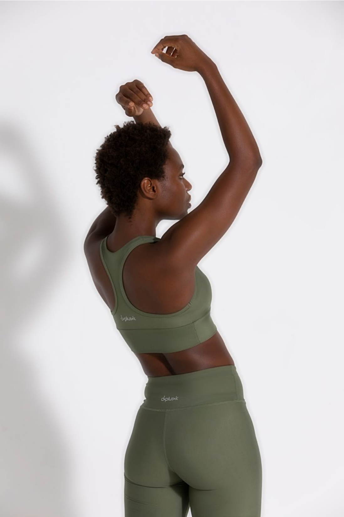
Conquer Crop & Assembly Bike Pant