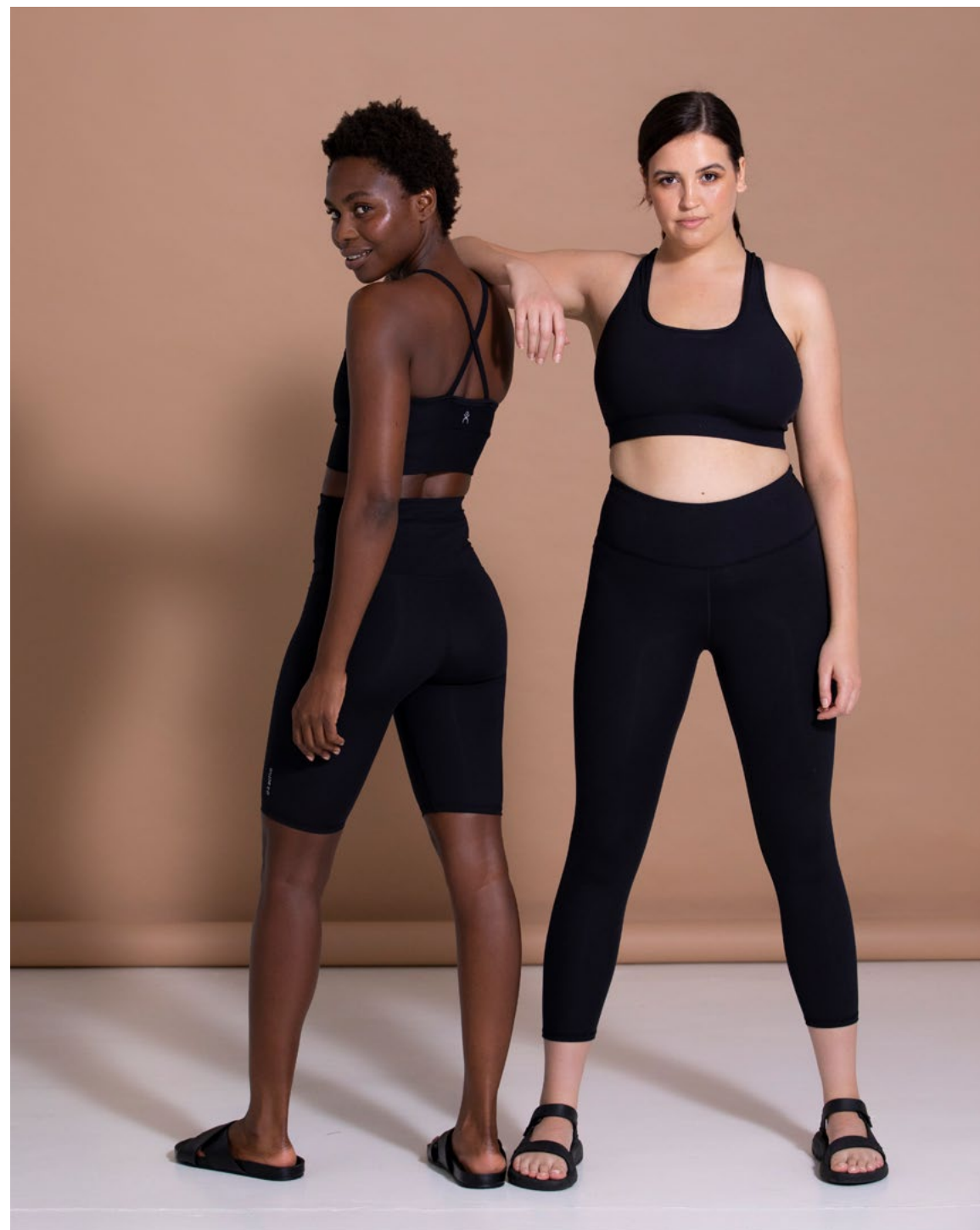
Chloe Crop & Highrise Longline Bike Pant Base Crop & Base Tight 7/8