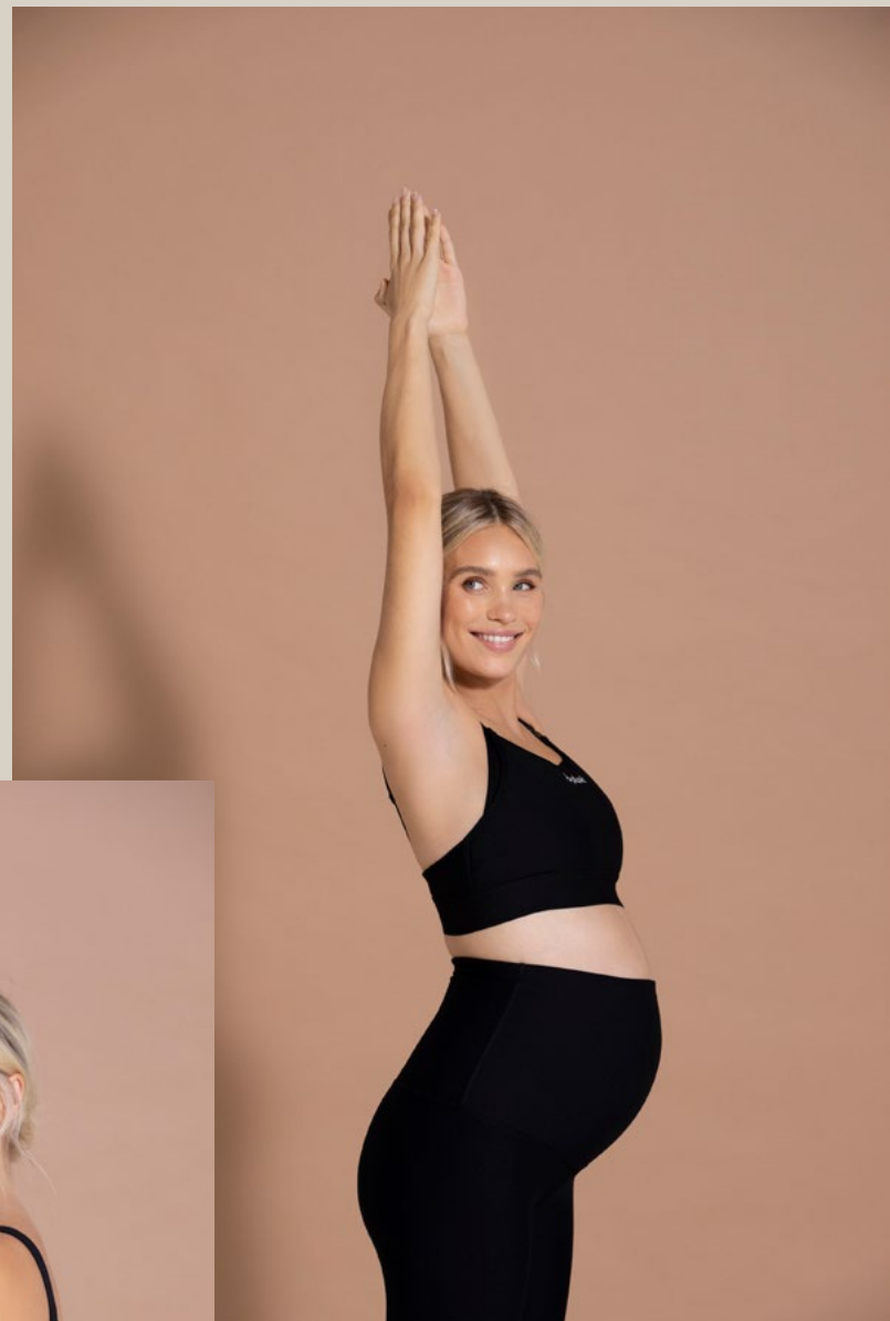
Lily Maternity Bra & Lotus Maternity Mid Tight