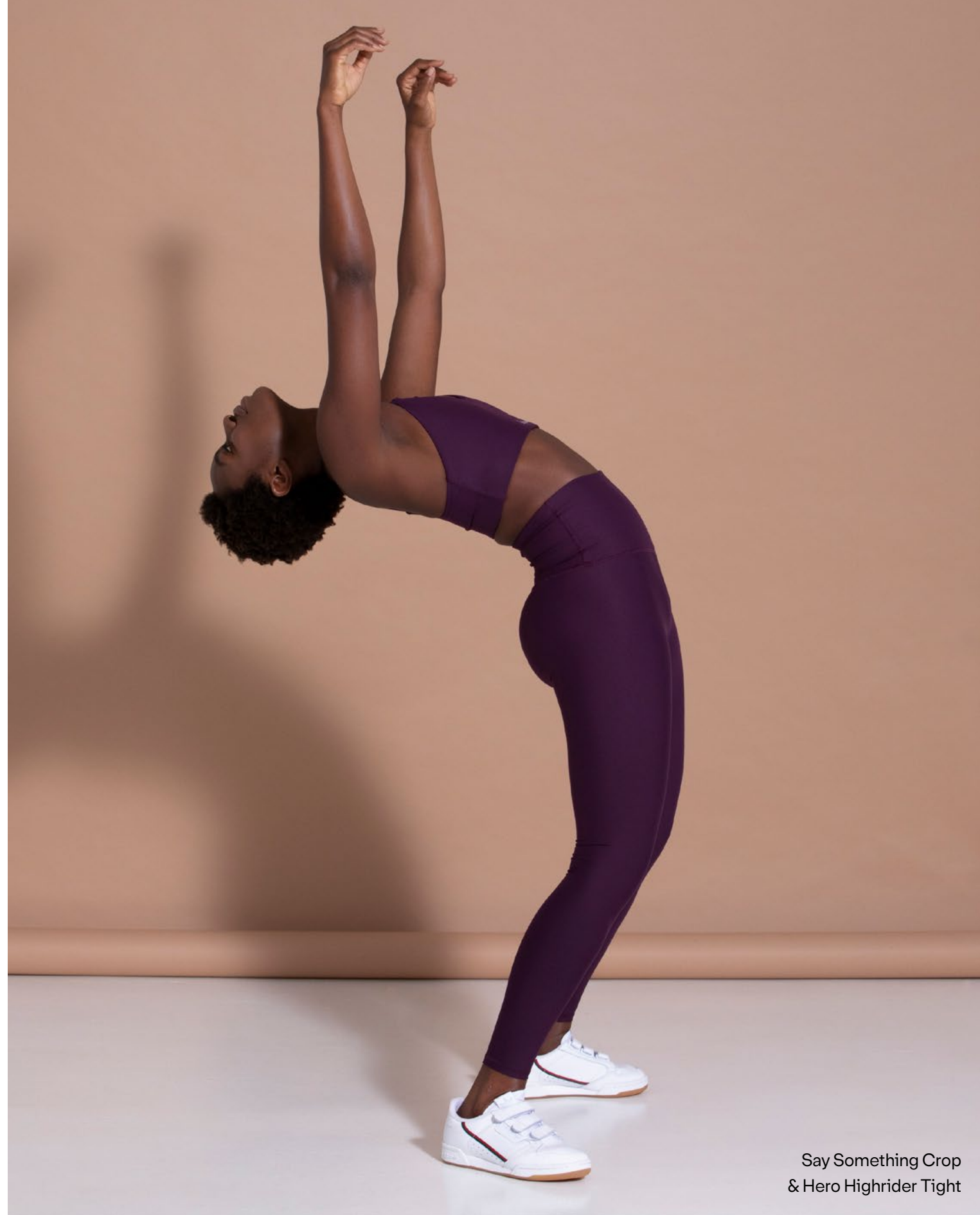
Say Something Crop & Hero Highrider Tight