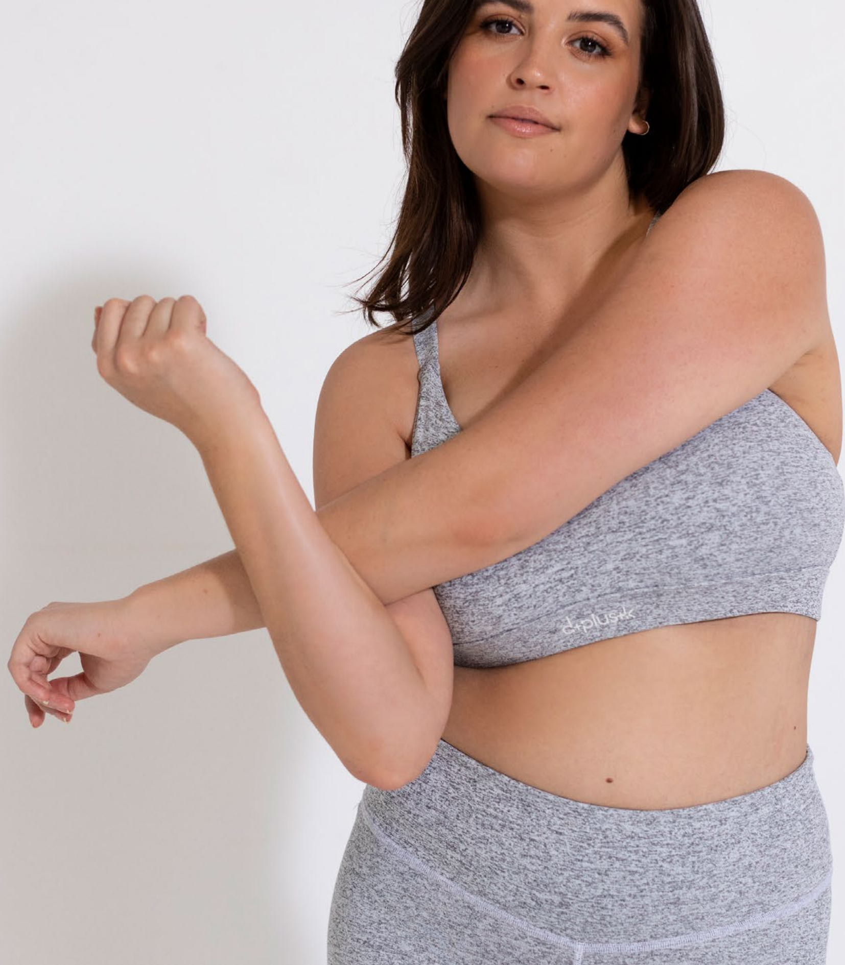
Ana Crop & Brightside Bike Pant