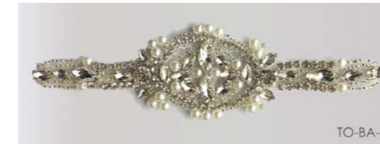
TO-BA-7 W/S 12.95 RRP 29.95 TO-BR-7 (WITH RIBBON) W/S 29.95 RRP 69.95