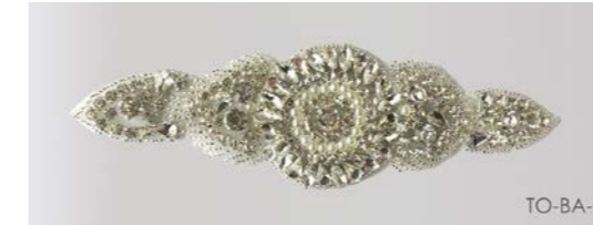
TO-BA-9 W/S 12.95 RRP 29.95 TO-BR-9 (WITH RIBBON) W/S 29.95 RRP 69.95