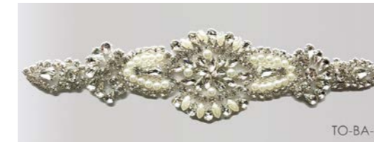
TO-BA-3 W/S 19.95 RRP 54.95 TO-BR-3 (WITH RIBBON) W/S 34.95 RRP 89.95