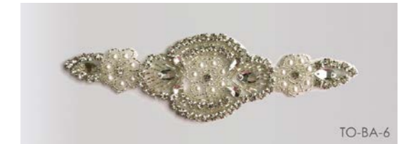
TO-BA-6 W/S 12.95 RRP 29.95 TO-BR-6 (WITH RIBBON) W/S 29.95 RRP 69.95