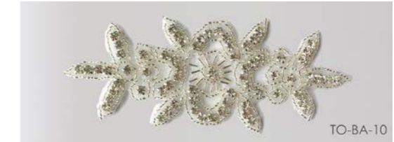
TO-BA-10 W/S 12.95 RRP 29.95 TO-BR-10 (WITH RIBBON) W/S 29.95 RRP 69.95