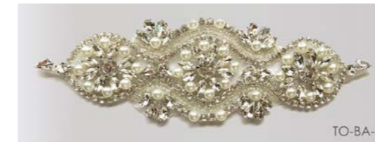
TO-BA-1 W/S 19.95 RRP 54.95 TO-BR-1 (WITH RIBBON) W/S 34.95 RRP 89.95