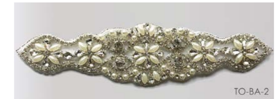
TO-BA-2 W/S 19.95 RRP 54.95 TO-BR-2 (WITH RIBBON) W/S 34.95 RRP 89.95