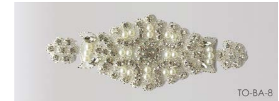
TO-BA-8 W/S 12.95 RRP 29.95 TO-BR-8 (WITH RIBBON) W/S 29.95 RRP 69.95