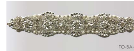
TO-BA-5 W/S 24.95 RRP 69.95 TO-BR-5 (WITH RIBBON) W/S 39.95 RRP 99.95