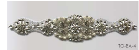
TO-BA-4 W/S 19.95 RRP 54.95 TO-BR-4 (WITH RIBBON) W/S 34.95 RRP 89.95